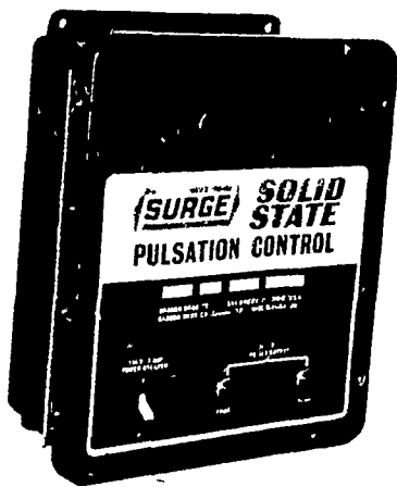
SOLID STATE PULSER