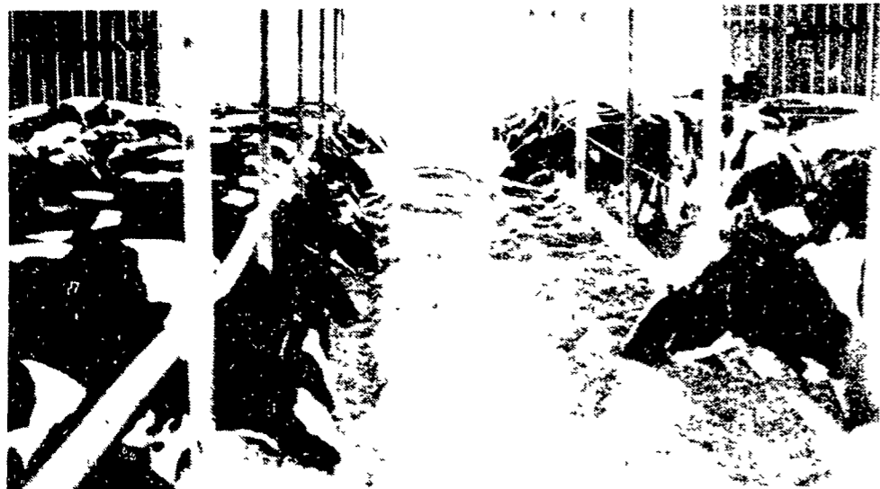
The Behrers feed their cows three separate rations according to production. The rations are mixed according to a Penn State forage testing service feeding program.