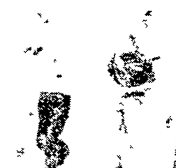
This concrete trellis corn on the Behrer farm.