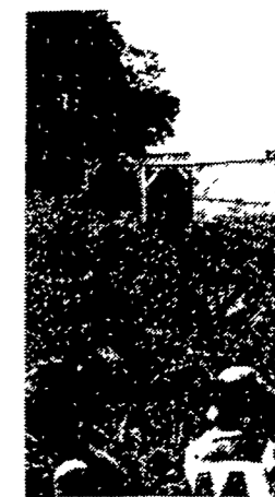
Heifers started in to 1 of the 25 outside