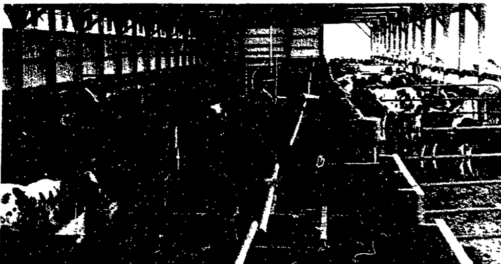
The new 80 stall calf barn at John and Mike Behrer's Farm permits easier handling and feeding. The Behrers have noticed less death loss and faster growth with the new calf barn.

A new 170 head free stall barn will be used by Bob Oliver to increase his herd size from 120 to 140 head with a total herd output forecast at 2.1 million pounds this year.