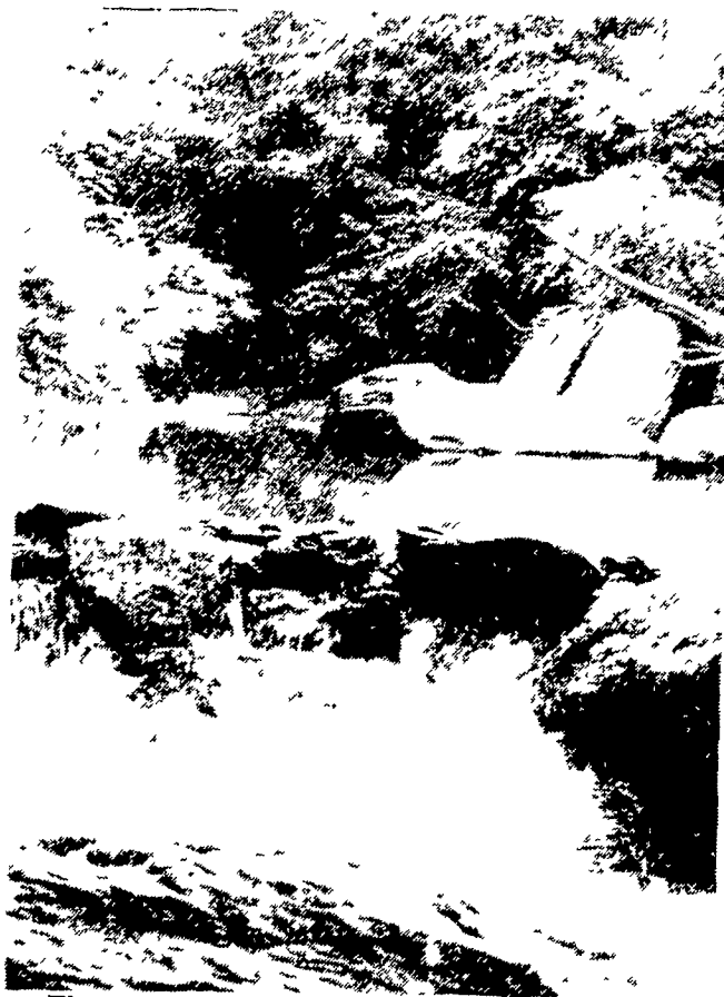
There's no doubt that the West Branch of Octorara has its wild and unspoiled scenery. This is along rocky area near Black Rock.

This is the first major court challenge of the so-called compatible uses along a Wild or Scenic River.