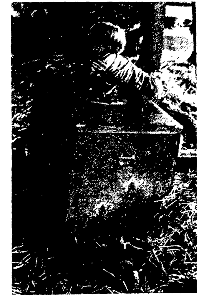
Wow, what a cow