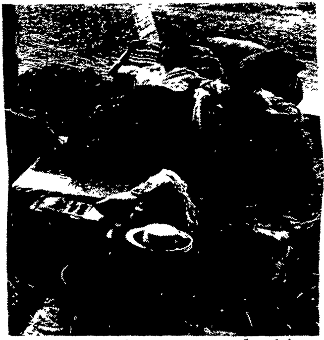
The rigors of showing can be tiring