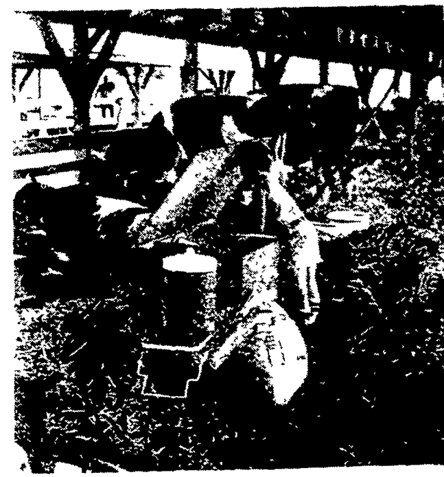
Hey, it's something more than a hat rack!

instamatic For after all, isn't that what it's all about — that feeling of accomplishment and pride in a job well done?