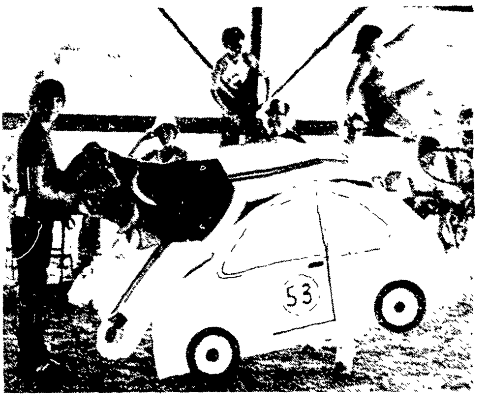
Beep, beep, Herbie