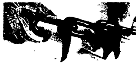
Patz double-hook gathering chain features cutters and claws

Want to know more about the Patz system? See your Patz dealer. He'll show you Patz quality and reliability — two important words to a farmer like you.