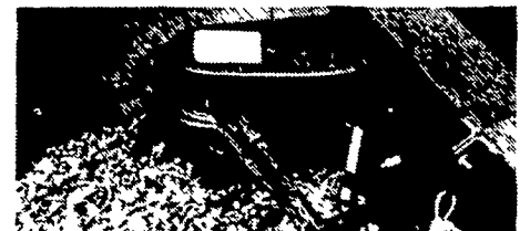
Rotating steel blades keep the silo wall free of silage buildup (shown without guards)

Patz Pound, Wisconsin 54161 U.S.A. Performance Strong as Steel