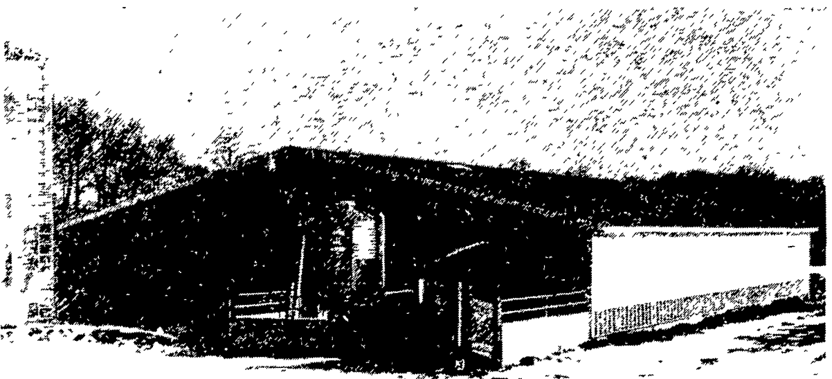
Farmer Boy Finishing Unit