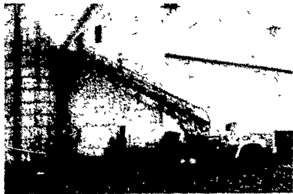
HYDRAULIC AERIAL EQUIPMENT