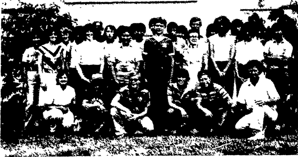
This group of 4-H youth and chaperones traveled to Dodge City, Kansas, returning home last week.