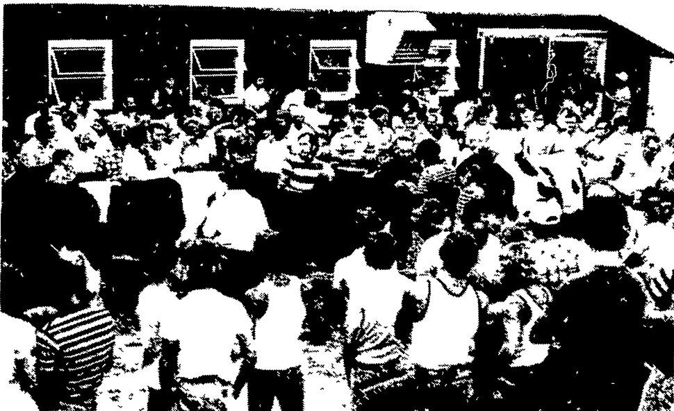
"Now, who doesn't agree with the official judge's placing?"

LEBANON — Close to 250 Holstein enthusiasts from Dauphin, Berks, Lancaster and Lebanon Counties turned out for the Lebanon County Holstein Association's Field Day on Wednesday evening.