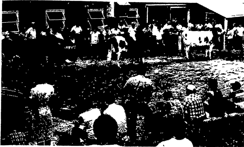
Judging a class of two-year-olds isn't as easy as it looks.