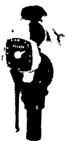
Model 1230C Filter Rotary Hand Pump