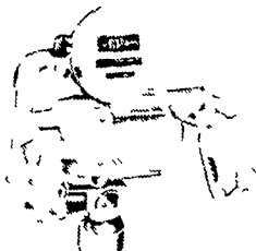
Model 72 Electric Compact