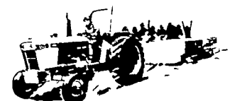
TRACTOR PULLING CONTEST

Monday, Tuesday, Wednesday & Friday 11 00 a m to 5 00 p m