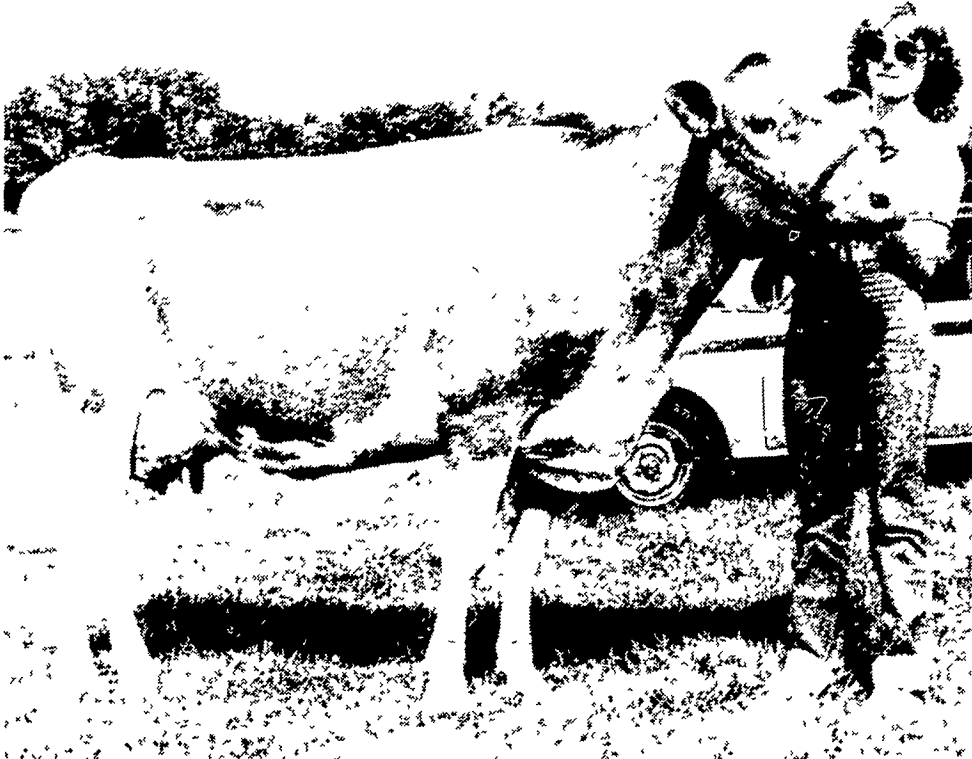
Sue Heilinger exhibited the grand champion Guernsey.

So set some time aside between August 4 and August 9 to travel the short distance to the Lebanon Fair Grounds, located 2 miles south of the Lebanon Plaza, at Cornwall and Evergreen Roads.