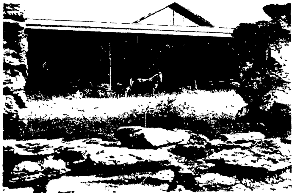
Pony and her colt are framed through foundation remains of original house on Longmead Farm.