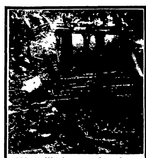
We will also modernize your existing buildings and equipment.

And Remember Once Your Hershey System Is Completed, Our Staff Will Continue To Service And Provide Spare Parts At Discounted Prices As We Have Done For Over 15 Years.