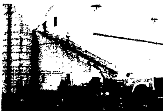
HYDRAULIC AERIAL EQUIPMENT