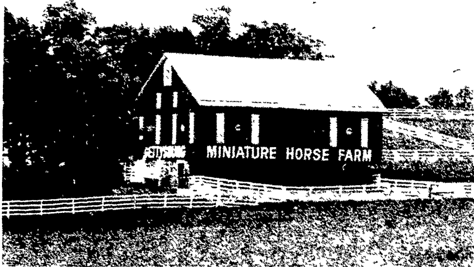
White board fence lines the country road leading to the home of Pennsylvania's smallest horses near Gettysburg.