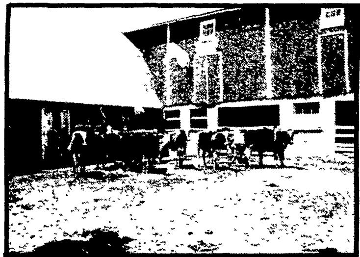
These thirteen (13) recipient heifers carry embryos from LEE and are due in January, 1981. We wish them as much success with these contract bulls as they had with HEINDEL KC KIRK JUPITER EX-GM at EASTERN AI