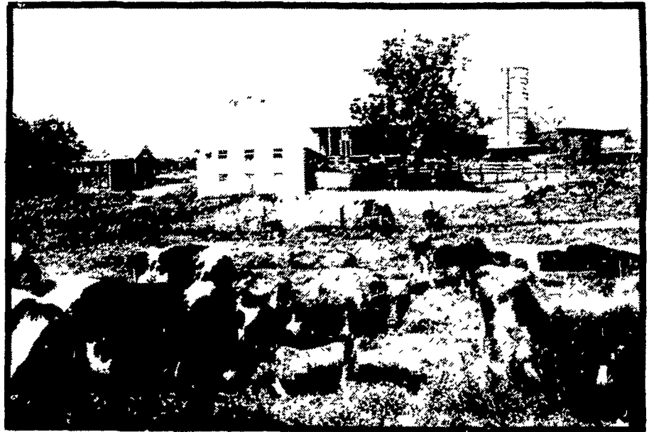
Both Holsteins and Ayrshires are fed 12-15 lbs. of hay per day. Corn silage is fed during winter months. Mixed legume-grass haylage is fed during summer and fall. Grain ration consists of home grains balanced with Brown's 38 MILKMASTER.