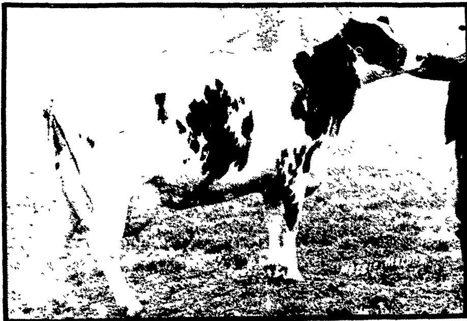
HEINDEL ROUNDOAK LISTA LEE EX-91 25,016 milk 1074 fat 4.3 test 318 days LEE has 2 sons at CARNATION and is contracted with ABS and ATLANTIC