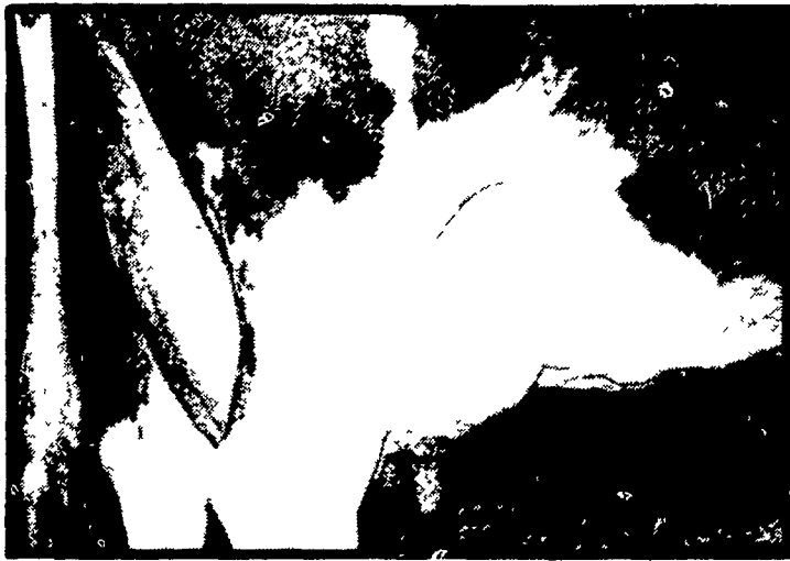
HEINDEL PRIDE PRINCESS VG-88 22,566 milk 886 fat 3.9 test 305 days This high producing Ayrshire has a son at Sire Power

HOLSTEIN: 19,945 MILK • 774 FAT • 3.9 TEST • 23 COWS AYRSHIRE: 15,439 MILK • 643 FAT • 4.2 TEST • 26 COWS