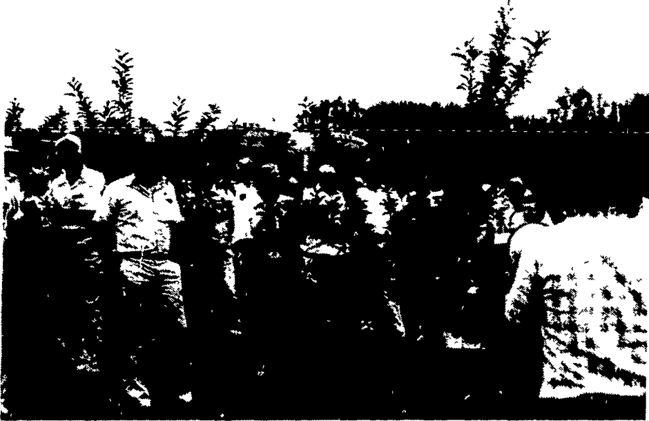
Group of fruit growers gather to hear explanation at one of many stops during recent tour of orchard operations in Bedford County.

When it was nearly dark a (Turn to Page C33)