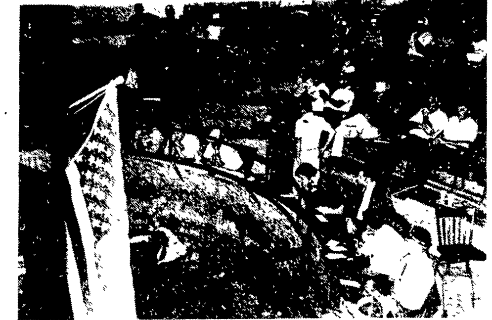
Buyers surround the semicircular auction ring and spectators alternately listen or not depending on what type animal charges from the doors.