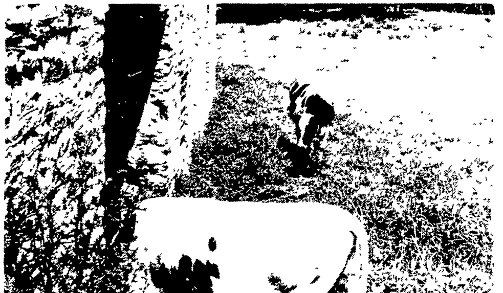
To escape hot afternoon sun, cows amble into stone mill, which provides cool shelter on a blazing July day.

The massive structure with its stone-arched doorways and huge interior beams offer an historic respite from the afternoon muggy heat. The mill dates back more than a couple of centuries to a time when the nearby hamlet of Millway lived up to its name