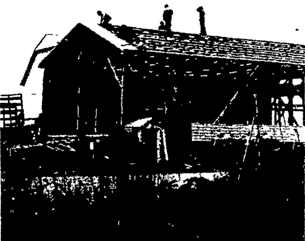
New tobacco shed rises on the Nolt farm. Work will begin soon on a barn to replace structure razed by fire.