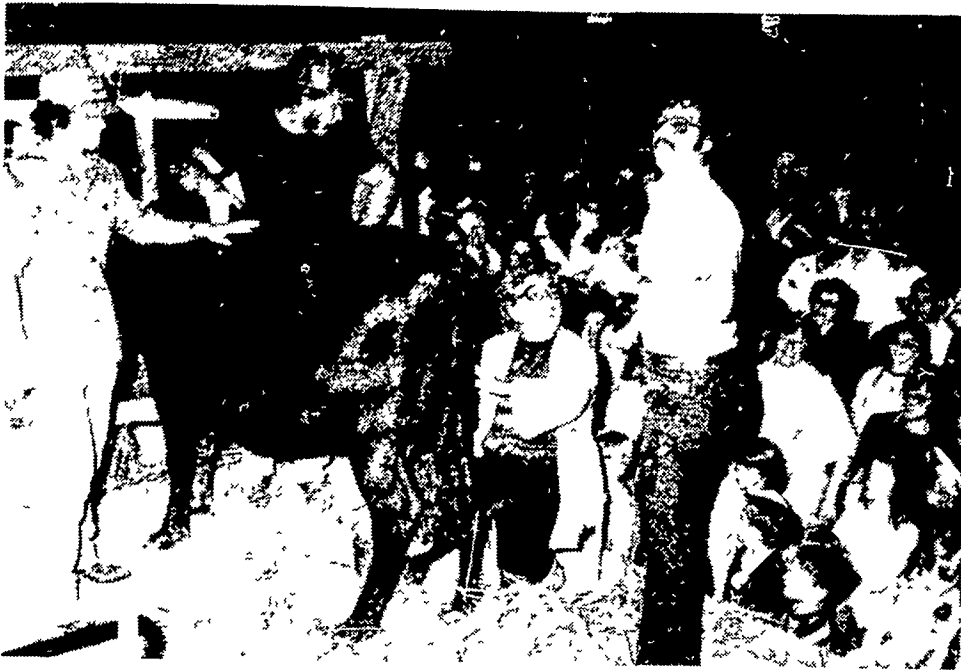
A cow milking contest was part of the Dairy Month activities recently in Dushore.