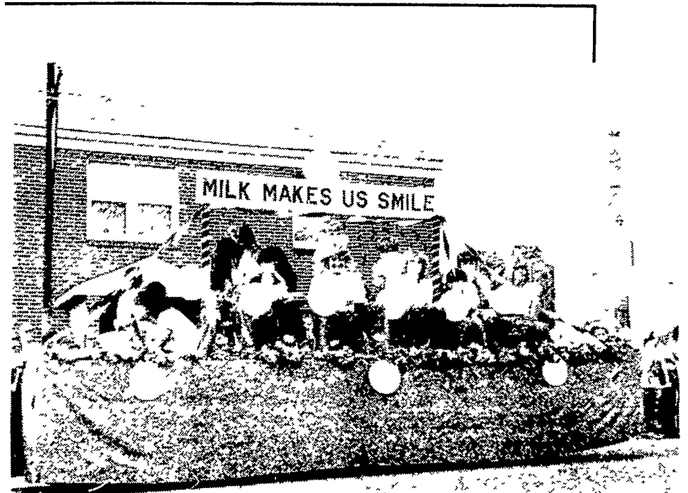
A parade held in Dushore during the afternoon Dairy Month activities brought over 700 people to the streets to celebrate. The parade was complete with 30 units and Mr. Cheese, a walking Agri-animal.