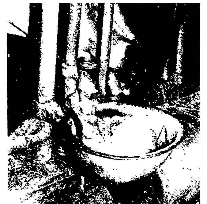
Farm cats have a way of adapting to their surroundings. This kitten is taking full advantage of a disconnected water bowl.