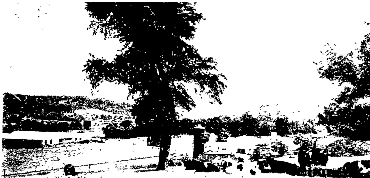
Overall view of the Wilkinson home farm, with dry cows seeking out afternoon shade on rolling hillside, includes two barn units with 150 free stalls each at

"We're farmers and we work on farms," they emphasize.—DA