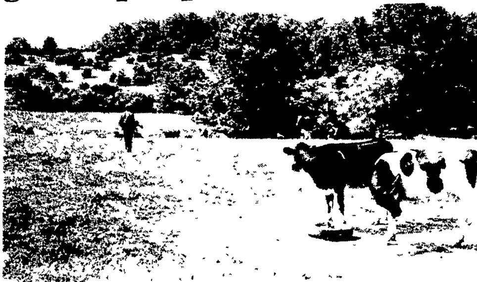
This is large rolling pasture from which bred heifers were recently stolen on Wilkinson Farms. Total stock numbers about 1,000, including milking herd, calves, heifers and steers.

The total Wilkinson operation covers quite an area. A younger brother,