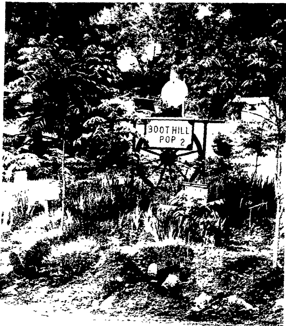
Perhaps some childhood fantasies or a need to clean the leaky boots out of the basement during Spring cleaning prompted this garden arrangement.