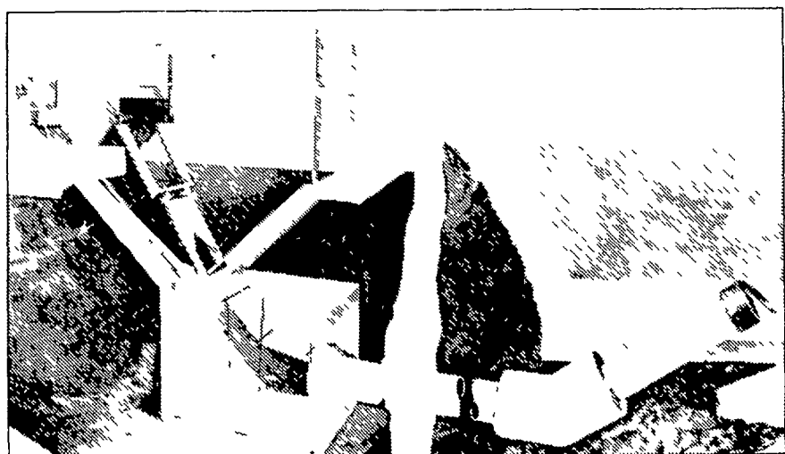
Patz Model 100 Manure Pump