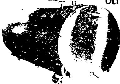
Pump shroud shown removed for detail

The Tank with Features no other tank can offer