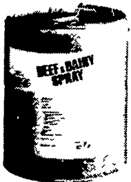
BEEF & DAIRY SPRAY

Now Is The Time To Think About Getting Rid Of Those Pesty Flies