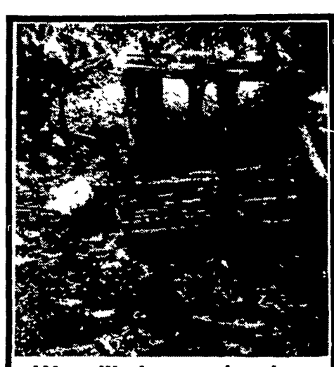
We will also modernize your existing buildings and equipment.

And Remember Once Your Hershey System Is Completed, Our Staff Will Continue To Service And Provide Spare Parts At Discounted Prices As We Have Done For Over 15 Years.