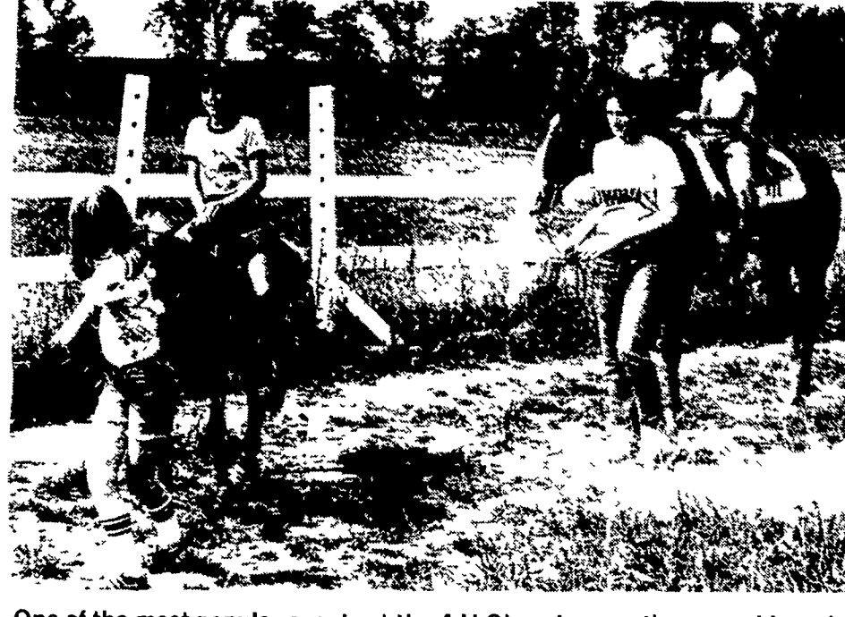
One of the most popular events at the 4-H Olympics was the pony rides taken during the free-time.