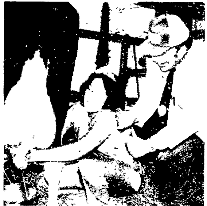
"Good two-handed technique fills the pail..."