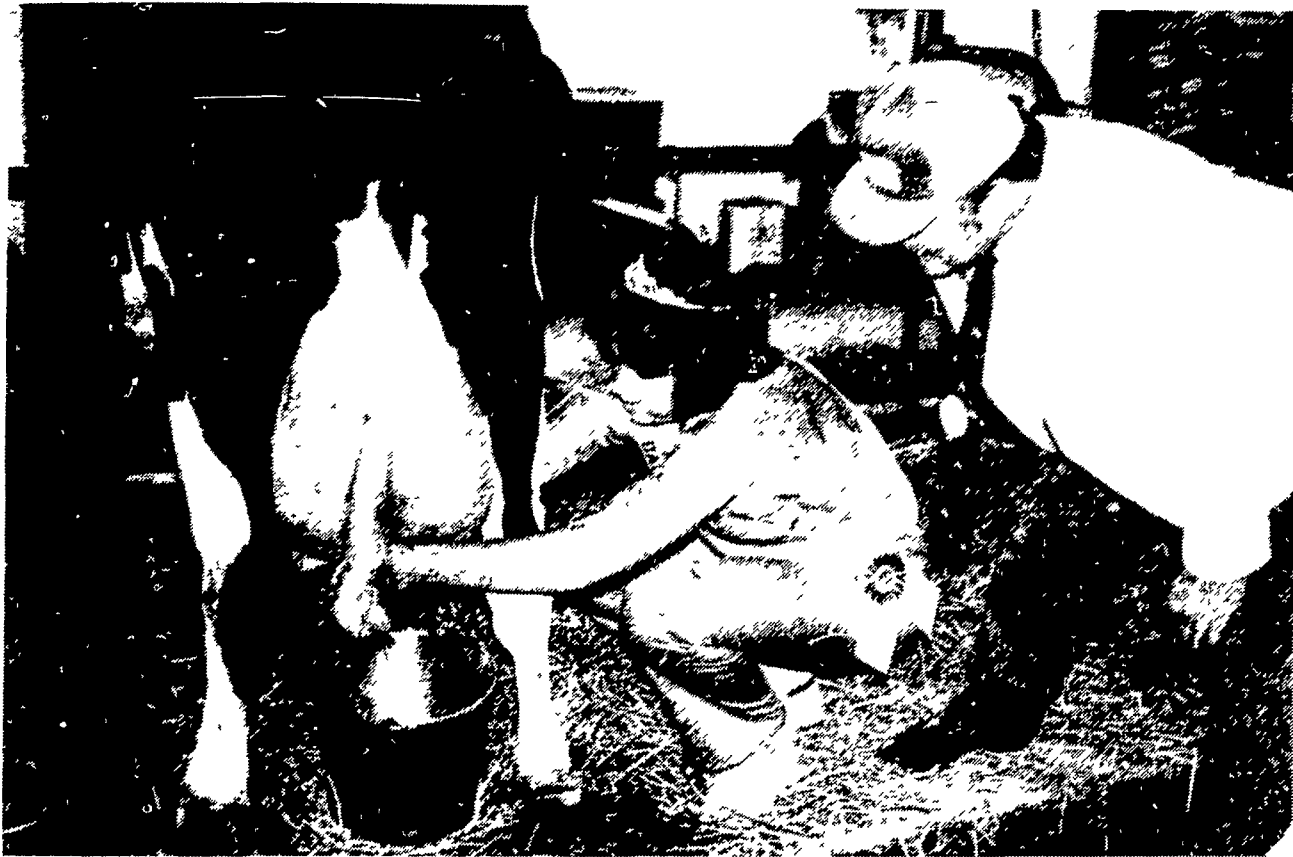
"Aha, so that's how a pro does it..."