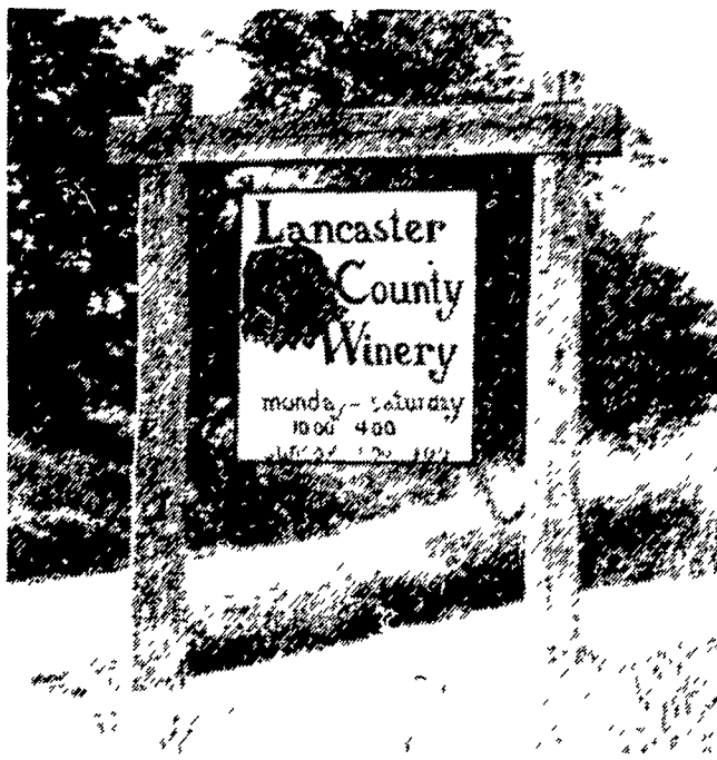
The sign in front of the winery clearly states their hours and uses the red rose logo that goes on all their wine.