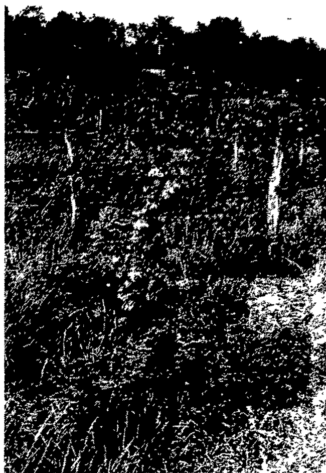
Acres of grapes cover the farm providing a pleasant place to browse when visiting the winery.