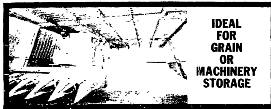
IDEAL FOR GRAIN OR MACHINERY STORAGE

40' x 50' x 14' FARMSTED I Galvanized Walls and Galvanized Roof with 20' x 13' D/S Door