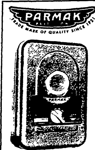
MECHANICAL 12 Volt $40.25

layers during the month was 2018 compared with 1994 a year ago.