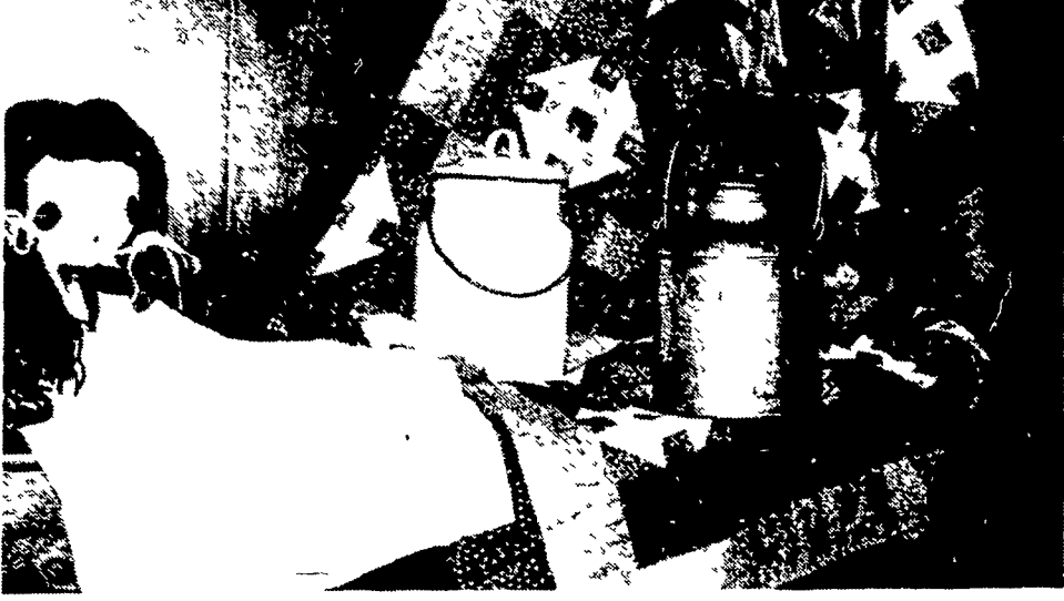
Gallon milk pails were a popular size for keeping milk cool first in the spring house and later in the ice box. Pail at left is made of agate while that at right is