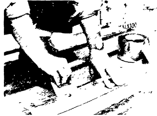
Applied by hand pressure, sealant tape molds itself to many surfaces for repairs.

In addition, it is ideal for sealing cracks, gaps, and is particularly suited for metal related applications because of its highly reflective finish. Uses include gutters and downspouts, glaze bars and roof lights in greenhouses, leaks in truck cabs and trailers, seams in air-conditioning ducts, around rooftop units, vents, awnings, metal outbuildings and utility sheds, and more.