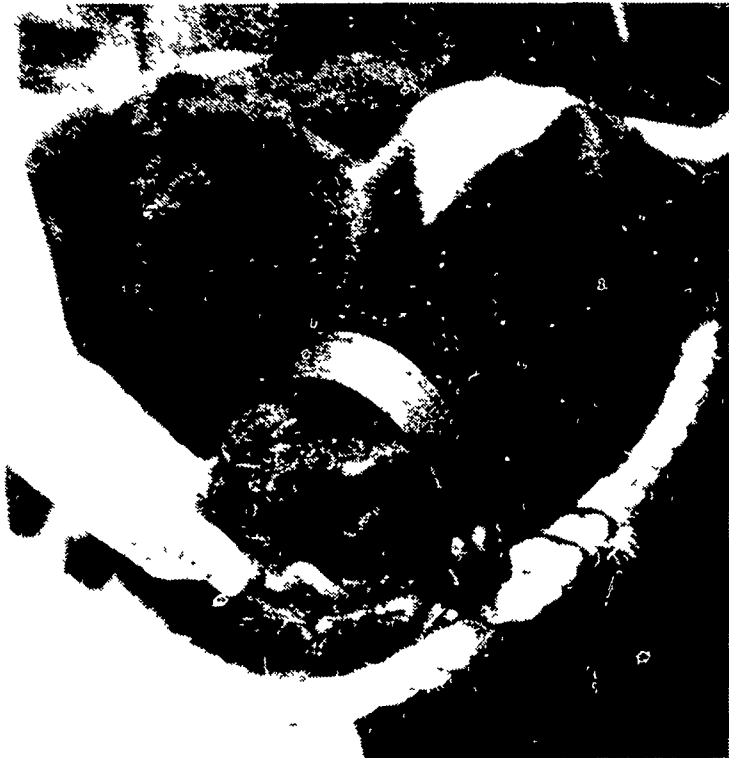
Rope and halter aren't needed to lead this calf. This youthful Holstein will follow that tasty hand most anywhere so long as it can nibble away on the fingers.