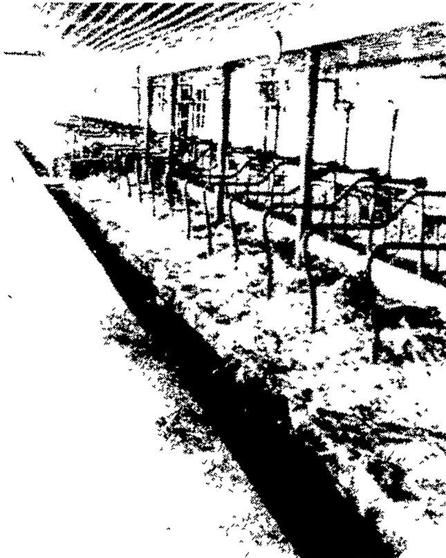
The 100 cow milking herd is housed in this station barn, with each cow's production chart and pedigree suspended above her.