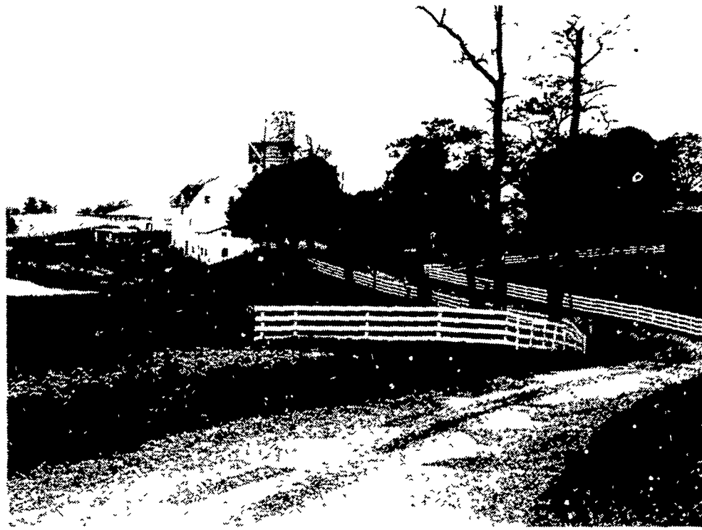
White board fences and neatly kept buildings confront visitors to Edgefield Farms.

for breeding purposes. These bull calves are raised to the age of 1 year on corn silage produced on the farm. Heifer calves are also raised (Turn to Page C34)