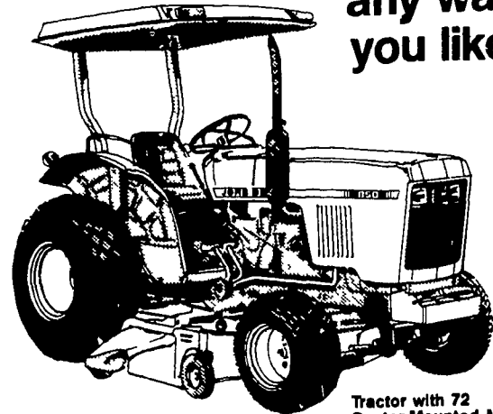
Tractor with 72 Center-Mounted Mower

John Deere 'Little-Big' Tractors cut it any way you like