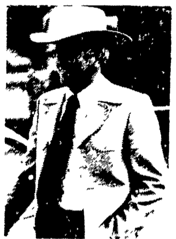
THE DETROIT CONNECTION