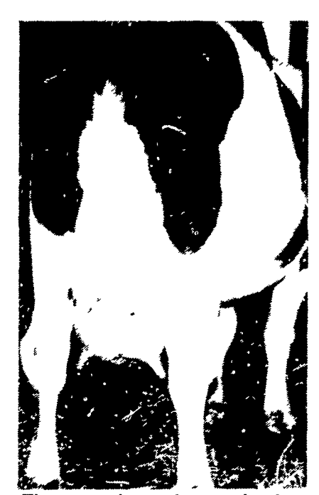
The cows butterfat production has risen to 3.89.