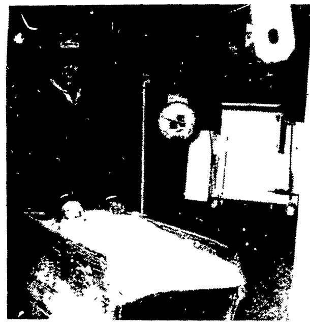
Larry weighs all the corn the cows consume.