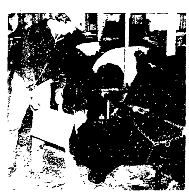
Cows are eager eaters when Larry feeds them Harvestore processed High Moisture Corn.

- "My cows always tested between 3.4 and 3.5 with dry ground ear corn. Since beginning HARVESTORE® High Moisture Corn in October 1979, the cows' butterfat production has risen to 3.89. My test has never been so good!"