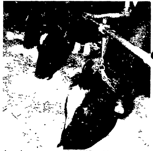
Larry's cows eat the HARVESTORE" High Moisture Corn much better than the dry corn that he used to feed them.