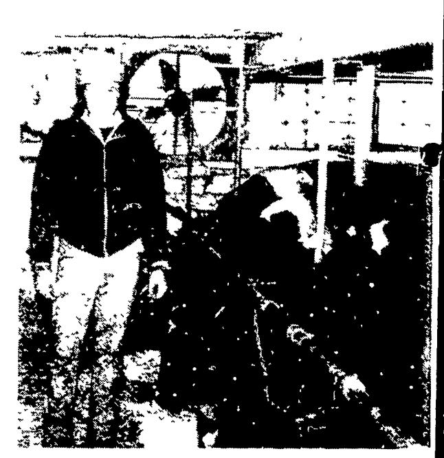
The increase in butterfat more than makes the monthly payments.