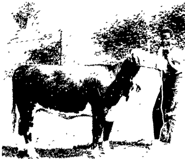
Jamal Hampton proudly shows one of the school's registered Polled Hereford heifers.