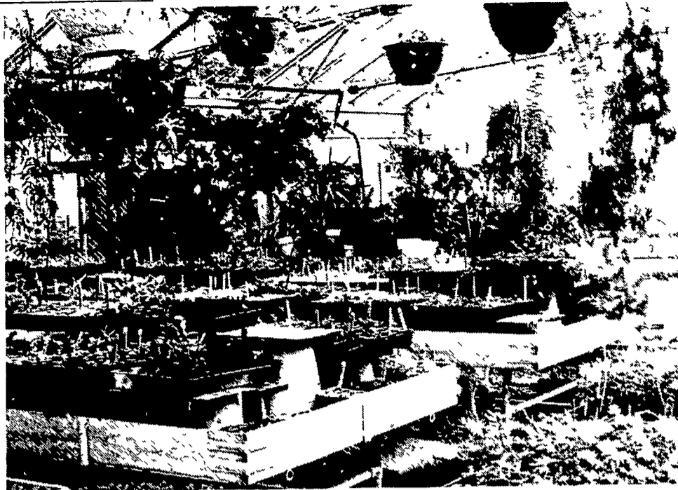
The greenhouses were open for parent and student inspection, with flats of vegetables and flowers on sale for the Philadelphia residents and visitors.