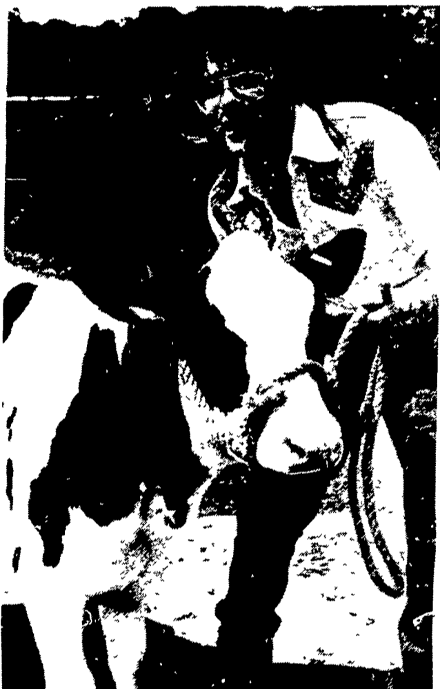
Aaron Weilerstein took reserve champion honors in the dairy showmanship and fitting, along with hog showmanship and fitting.