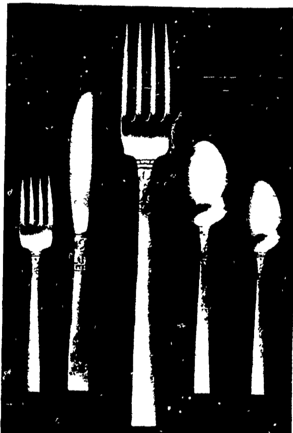
DANISH MODERN BROOKWOOD