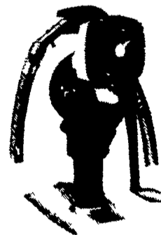
Model 1230C Gasboy-Counter