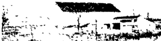
Built in 1943