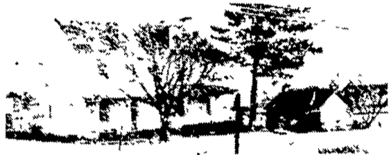
Built approx. in 1761

Erected thereon the following improvements: