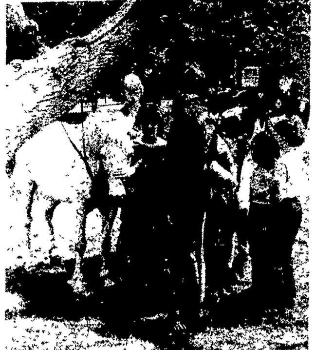
The pony received a lion's share of the attention from the second and third graders at Eshelman. After their encounter with the animals, the children each received a coloring book from the FFA.