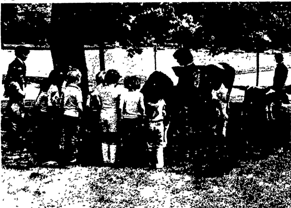
Questions like-How does the cow make milk? and How does it get to the store? and Will she eat grass? were adeptly fielded by the FFA members.