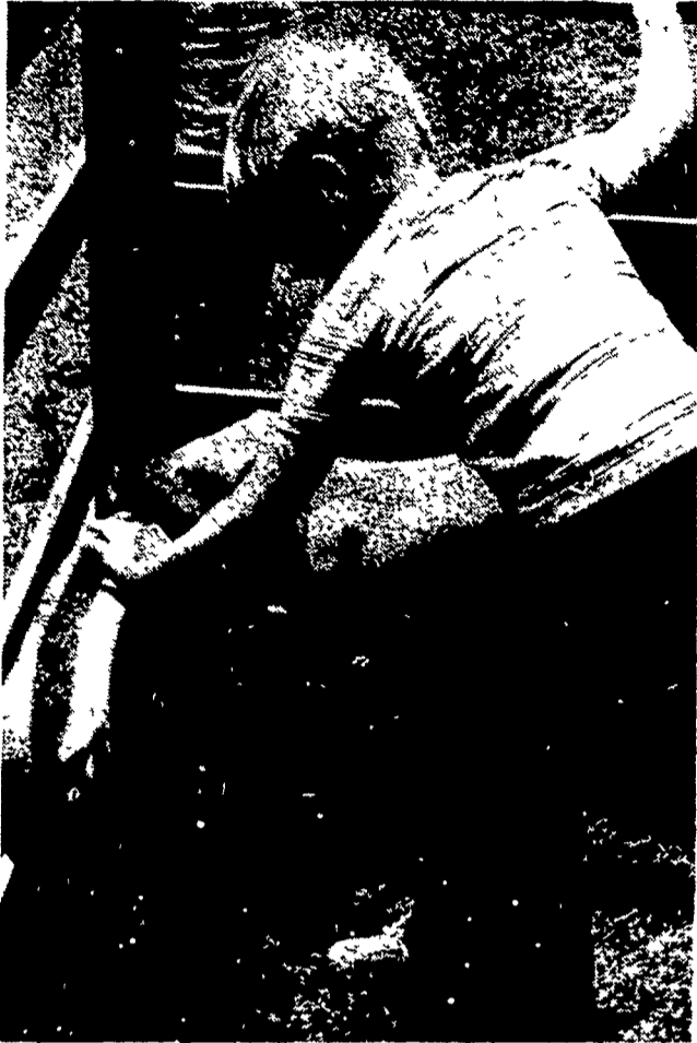
Many youngsters refused to touch the pigs. This young man approaches the swine timidly. Others were bold enough to pick the piglets up by the back feet to hear them squeal. And one young man needed an answer to the question, "Do they speak pig latin."