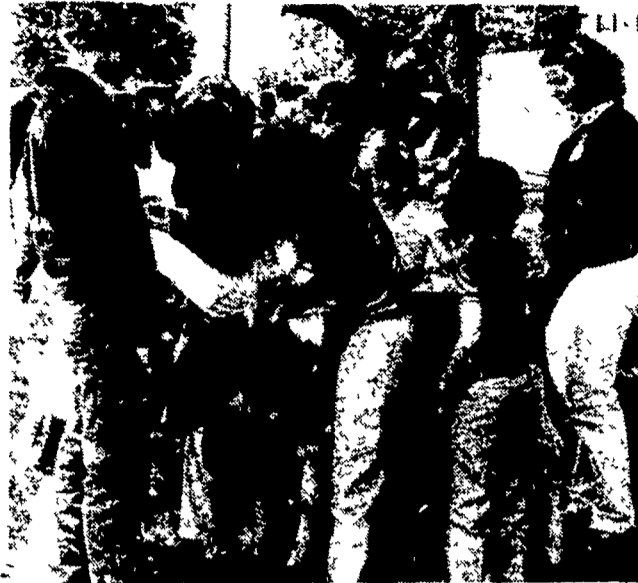
While the cows received gentle pats, this calf received hugs and oohs from the children as they rubbed their hands over its soft hair.