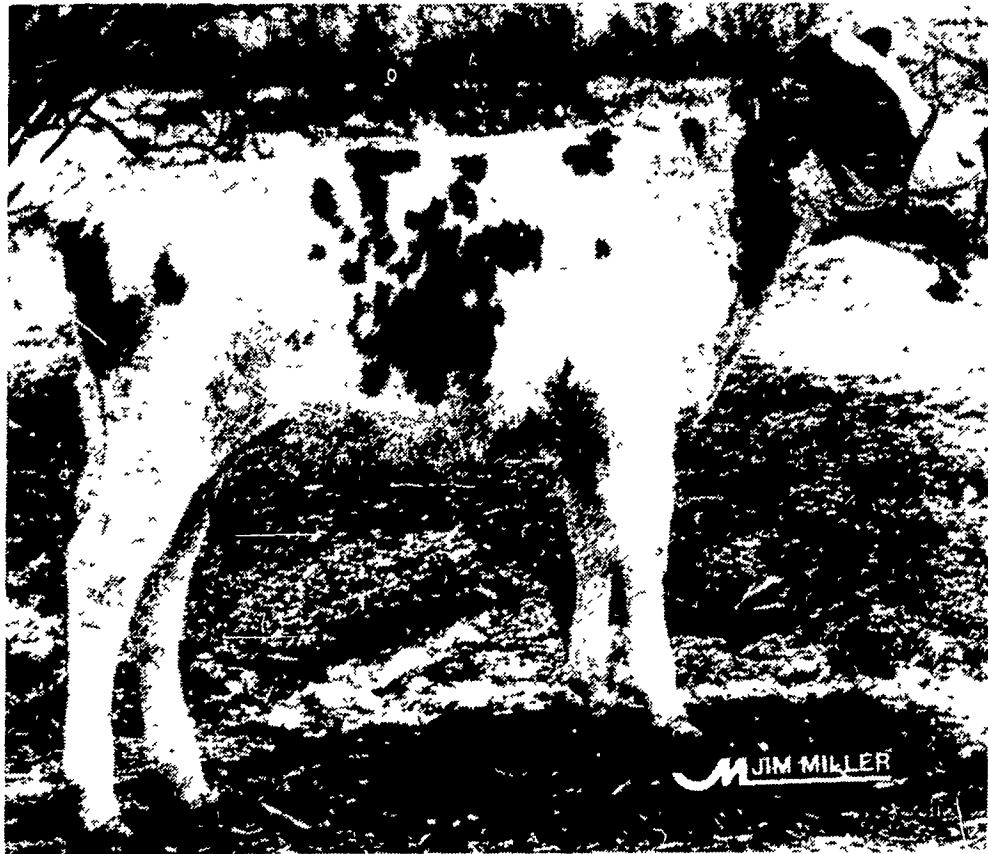
Artim Molly Chief Tammy-Red brought a top sale price of $4,400 at the Second International Red & White Heifer Sale.