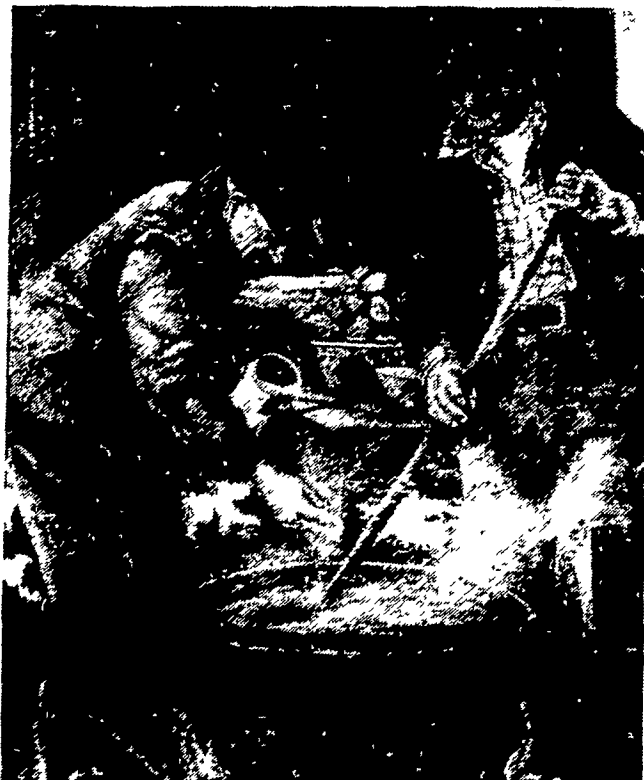
Ponhaus. This oil painting features butchering which is still a common occurrence in Hetterville.