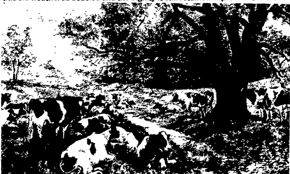
Beside Still Waters. The serenity of the cows resting in a cool pasture setting is a refreshing change from the work-a-day world.