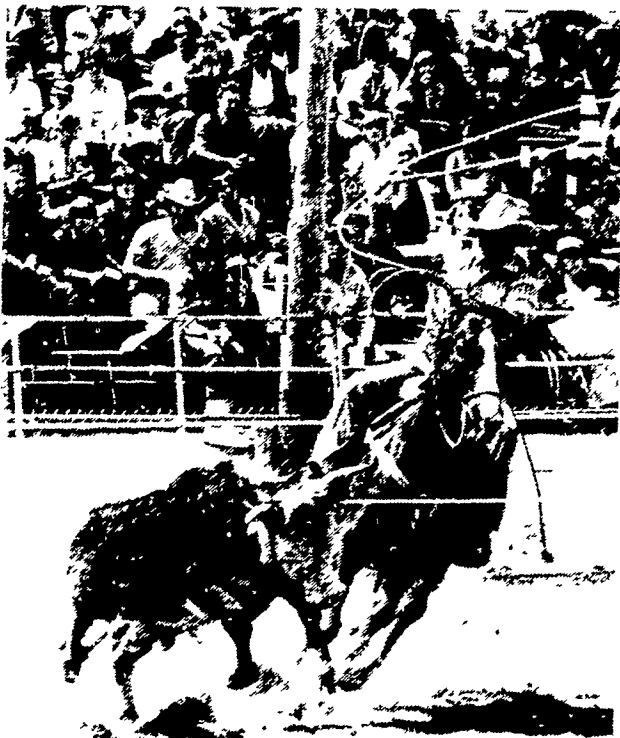
Calf roping is always one of the crowd favorites. Saturday's event proved no exception as riders tried their luck at catching fleetfooted calves