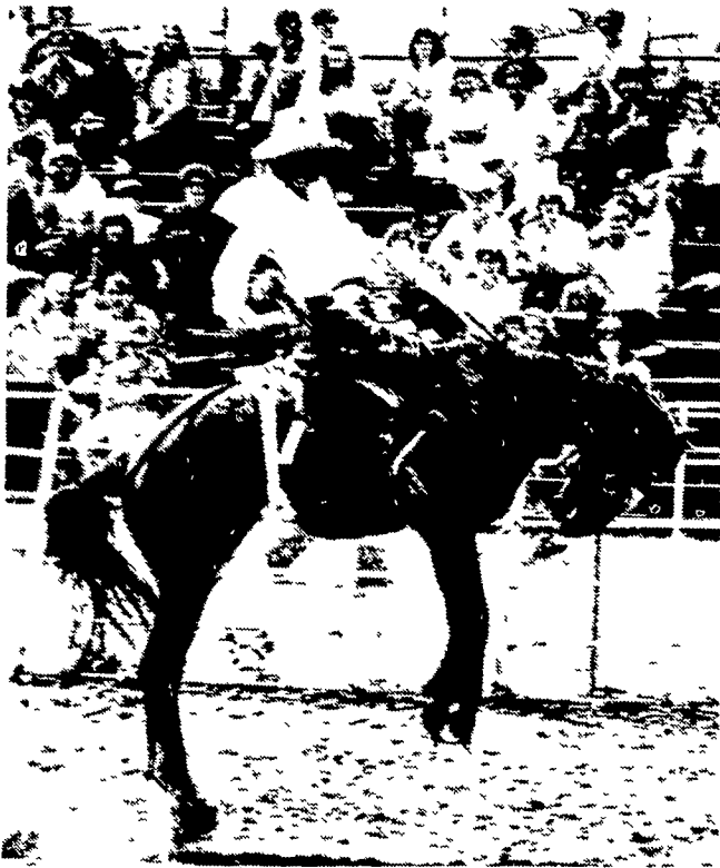
High bucking horses and bulls were the highlight of the afternoon session as the rodeo started its 1980 season. Here the rider sticks with the horse's swell.