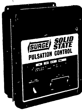
SURGE SOLID-STATE PULSER