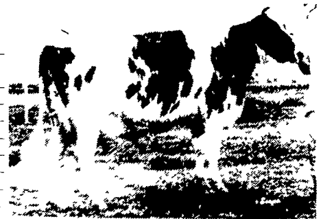
DAM GLEN RUN FOND LOIS, EX-93-2E Cal Clark Farm Hanford CA

Bangor, PA Baptistown, NJ Columbia, PA Ephrata, PA Holtwood, PA Lebanon, PA Leola, PA Newville, PA Port Murray, NJ Prospectville, PA Reading, PA Stewartstown, PA Thomasville, PA West Grove, PA Elmer, NJ Taneytown, MD Mt Airy, MD Monroeville, NJ Taneytown, MD Mt Airy, MD